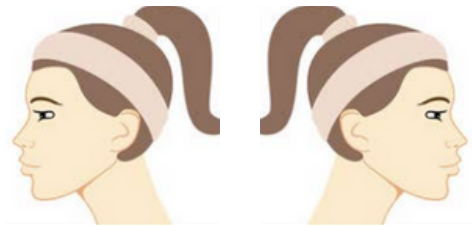
LEFT and RIGHT Eyes Forward