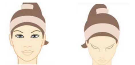
FRONT Eyes Forward and Head Down