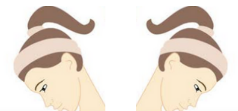
LEFT and RIGHT Head Down