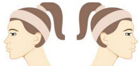
LEFT and RIGHT Eyes Forward