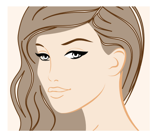
Right Side - 45 Degree Angle