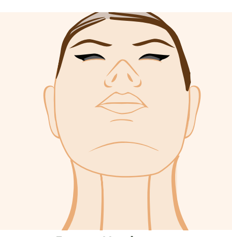
Front - Up the nose