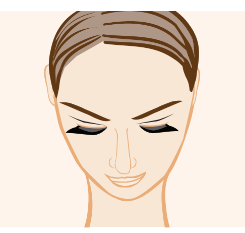
Front - Down the nose