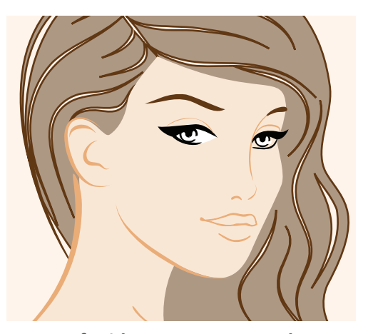
Left Side - 45 Degree Angle